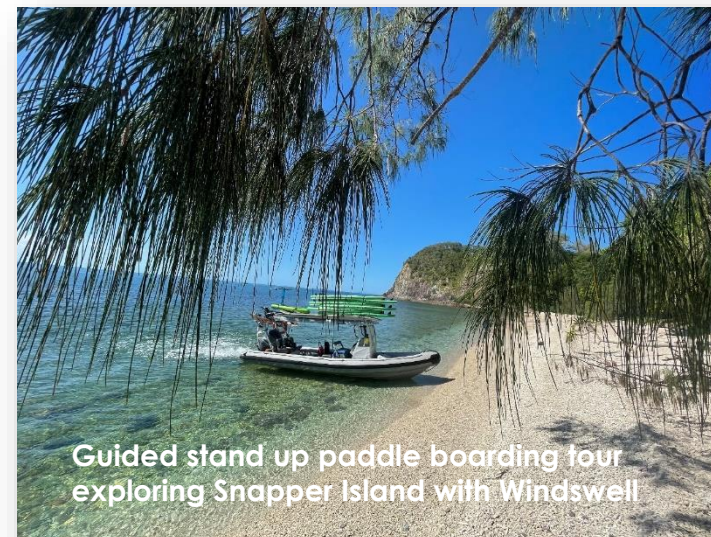
Guided stand up paddle boarding tour exploring Snapper Island with Windswell

If you do not have your own transport to Snapper Island which is accessible only by boat, WindSwell can do high speed boat transfers Ex Port Douglas to and from Snapper Island and then drop offs along the Daintree coast to your chosen accommodation or tour company. Bookings can be made by calling Brett on 0427 498 042 or emailing windsweelkitesurfing@gmail.com .