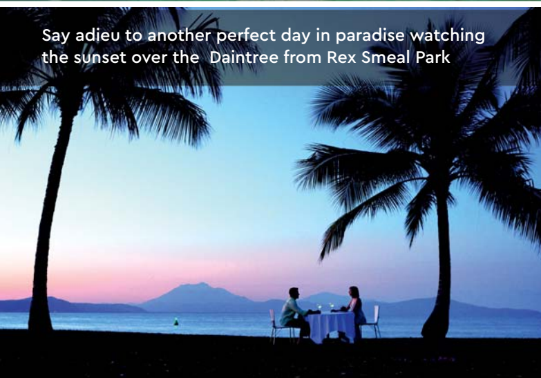
Say adieu to another perfect day in paradise watching the sunset over the Daintree from Rex Smeal Park