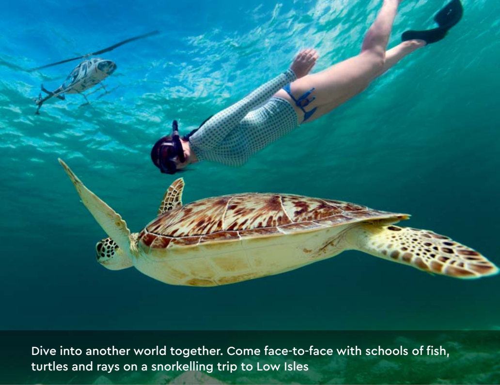
Dive into another world together. Come face-to-face with schools of fish, turtles and rays on a snorkelling trip to Low Isles